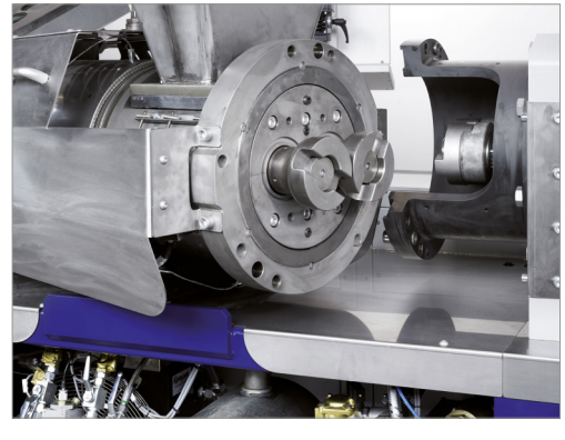
MAS 75 swiveling unit for screw removal

The MAS Extruder is controlled via a modern industrial control system with an 18.5" Multi Touch Panel and an intuitive interface. The MAS Software includes but is not limited to the following functions: automated start up and shut down procedures, recipe management, language control, unit switching, fault indication and logging, trend display (current and historical), operator management, data logging of events (user registration, change in value, ...), multi-touch and gesture control, remote diagnosis etc.