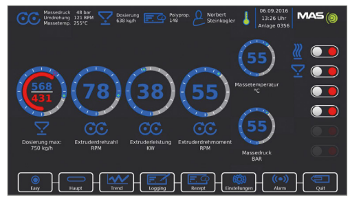
MAS multi-touch panel interface