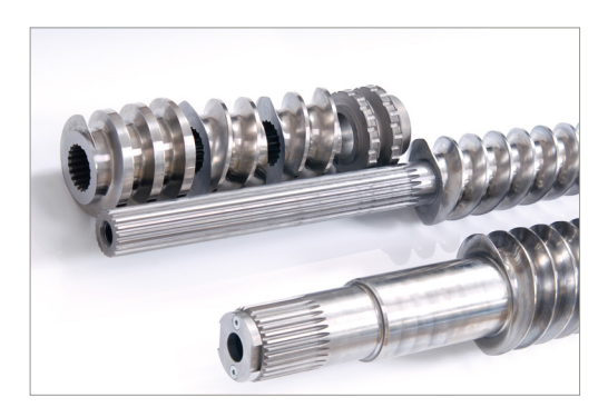
Screw segments: intake, mixing elements, discharge