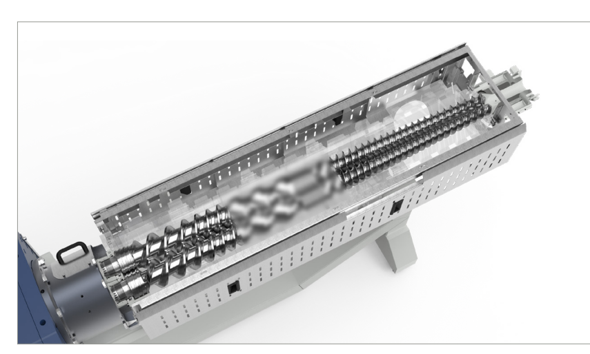
Large Feed Opening with enormous intake-volume and therefore good intake behavior

*Throughput depending on viscosity and properties of the input-material, type and degree of contamination as well as filtration-fineness.