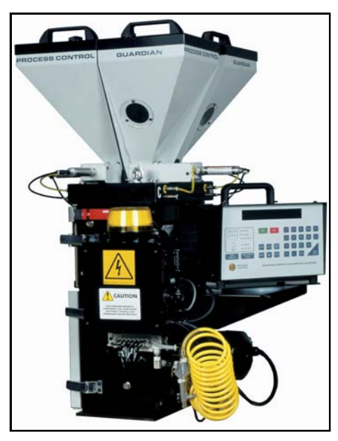
Guardian<sup>®</sup> Model WXA012 for up to 4 Components.